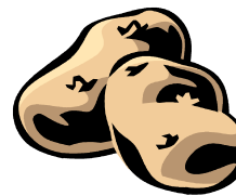
Baked Potato, with skin