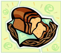
Whole Grain breads and Iron-fortified Cereals